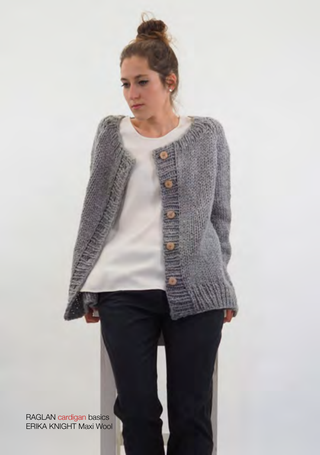
RAGLAN cardigan basics ERIKA KNIGHT Maxi Wool

ERIKA KNIGHT Maxi Wool 100% new wool 80 pr. 50g Ndl. 10 - 12 mm 9 = 10 cm COL 220 Fury