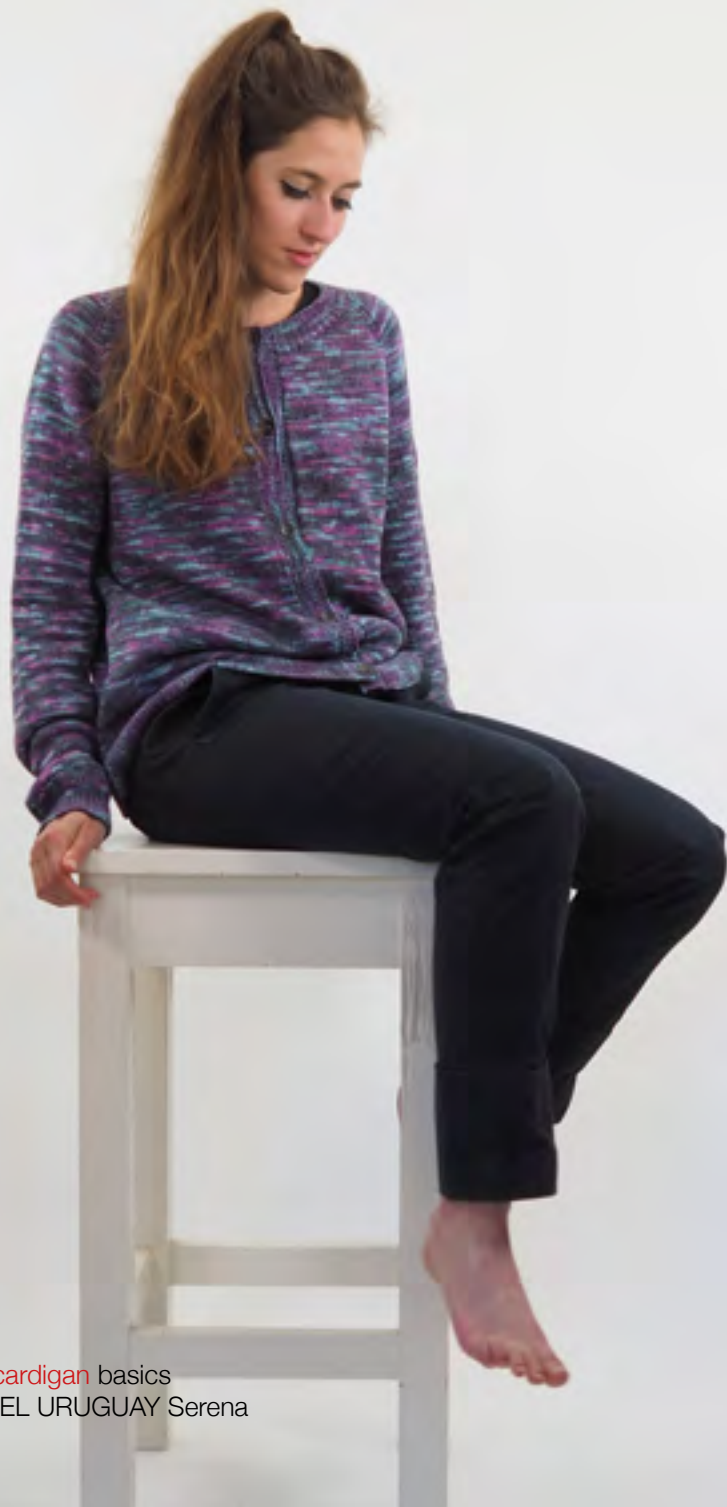
RAGLAN cardigan basics MANOS DEL URUGUAY Serena

MANOS DEL URUGUAY SERENA 60% Alpaca, 40% Cotton 193m pr. 50g Ndl. 2,5 - 3,5 mm 22 = 10 cm COL 9995 Jewel