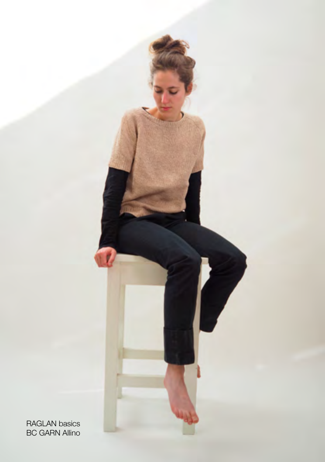
RAGLAN basics BC GARN Allino

BC GARN ALLINO 50% Linen, 50% Cotton 125 pr. 50g Ndl. 3 - 3,5 mm 22 = 10 cm COL 03 Camel