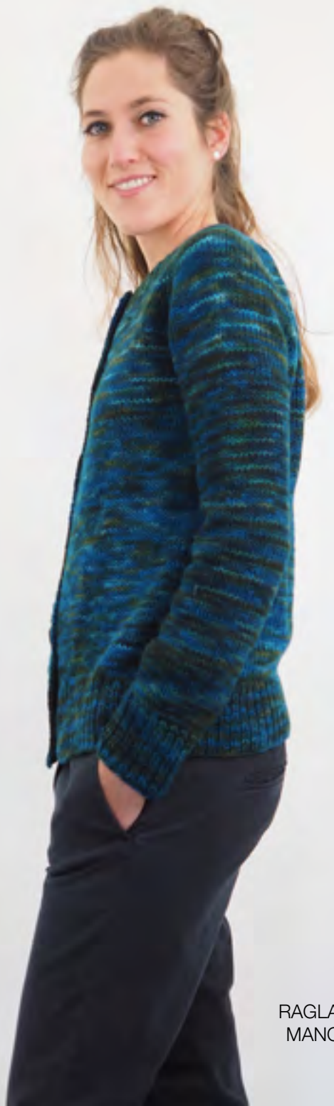
RAGLAN cardigan basics MANOS DEL URUGUAY

MANOS DEL URUGUAY MAXIMA handdyed 100% new wool (Merino) 200 pr. 100 g Ndl. 5 - 6 mm 16 = 10 cm