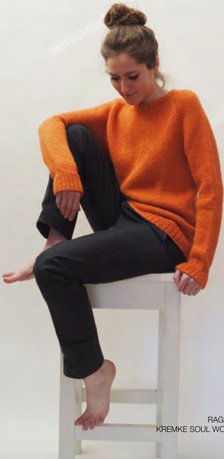
RAGLAN basics KREMKE SOUL WOOL LLAMA