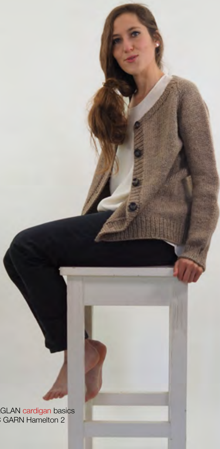
RAGLAN cardigan basics BC GARN Hamelton 2