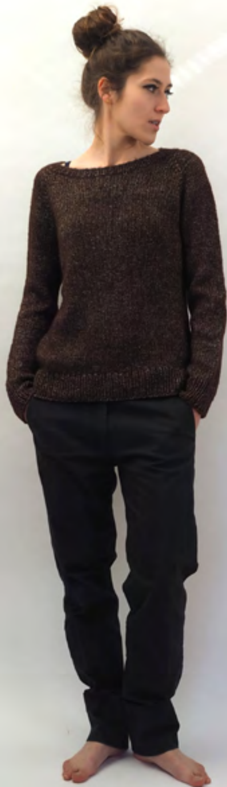
RAGLAN basics KREMKE SOUL WOOL Breeze

KREMKE SOUL WOOL Breeze 61% Silk, 39% Pure Wool 100 pr. 50g Ndl. 5 - 5,5 mm 16 = 10 cm COL11 Brown