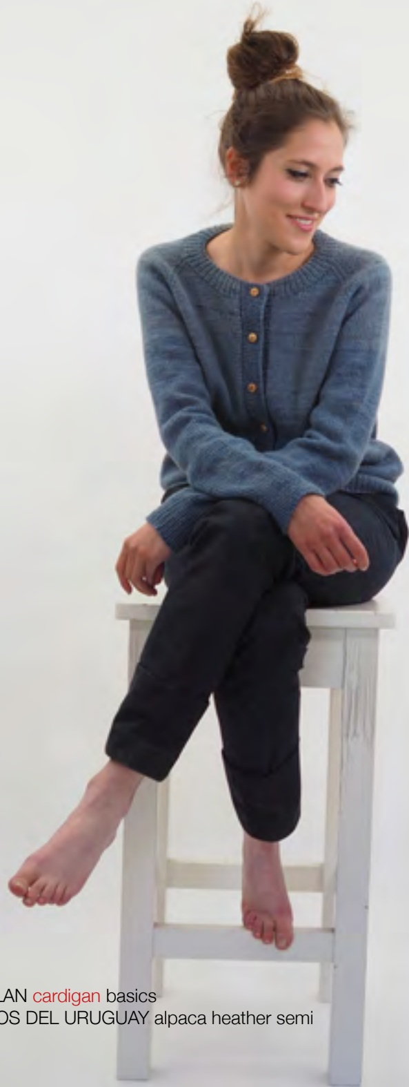
RAGLAN cardigan basics MANOS DEL URUGUAY alpaca heather semi

MANOS DEL URUGUAY ALPACA HEATHER SEMI SOLIDS 70% Wool, 30% Alpaca 150 pr. 50g Ndl. 3 - 3,5 mm 26 = 10 cm COL 2446 Petrol