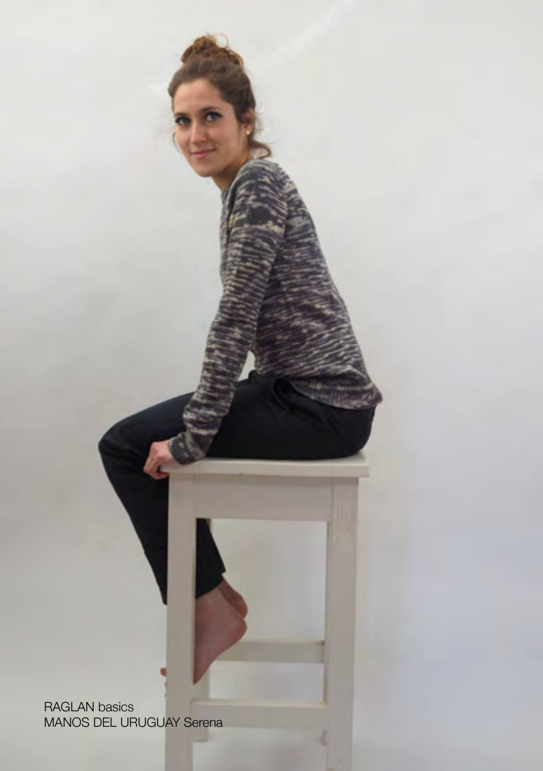
RAGLAN basics MANOS DEL URUGUAY Serena

MANOS DEL URUGUAY SERENA 60% Alpaca, 40% Cotton 193m pr. 50g Ndl. 2,5 - 3,5 mm 22 = 10 cm COL 7311 Zebra